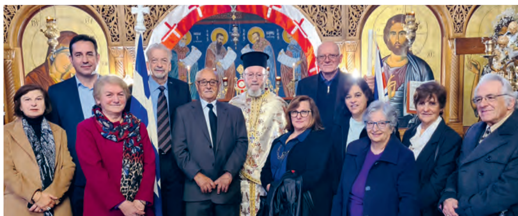
Δοξολογία για την Ένωση της Επτανήσου με την Ελλάδα από τον Οργανισμό Ιονίων Νήσων, στις 21 Μαΐου 2023 στον Ιερό Ναό Μεθοδίου και Κυρίλλου. Church service celebrating the anniversary of the unification of the Eptanesian Islands with Greece (1864)

Ιδιαίτερες ευχαριστίες σε όσους προσέφεραν εις μνήμη στον Οργανισμό Φροντίδα και τον Σύνδεσμο Ιθακησίων. Νίκος Μαρία και οικογένειες